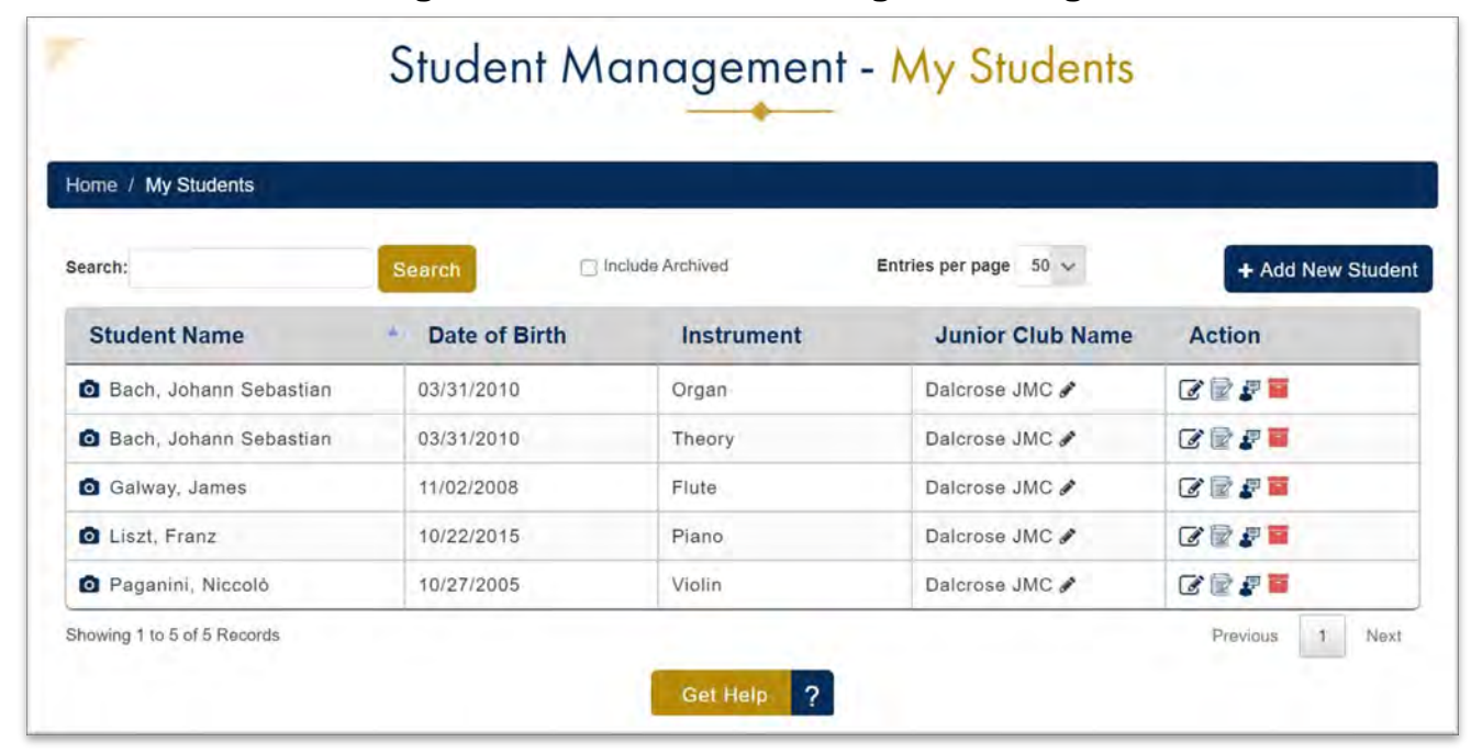
Fig. 1 Vivace Student Management Page